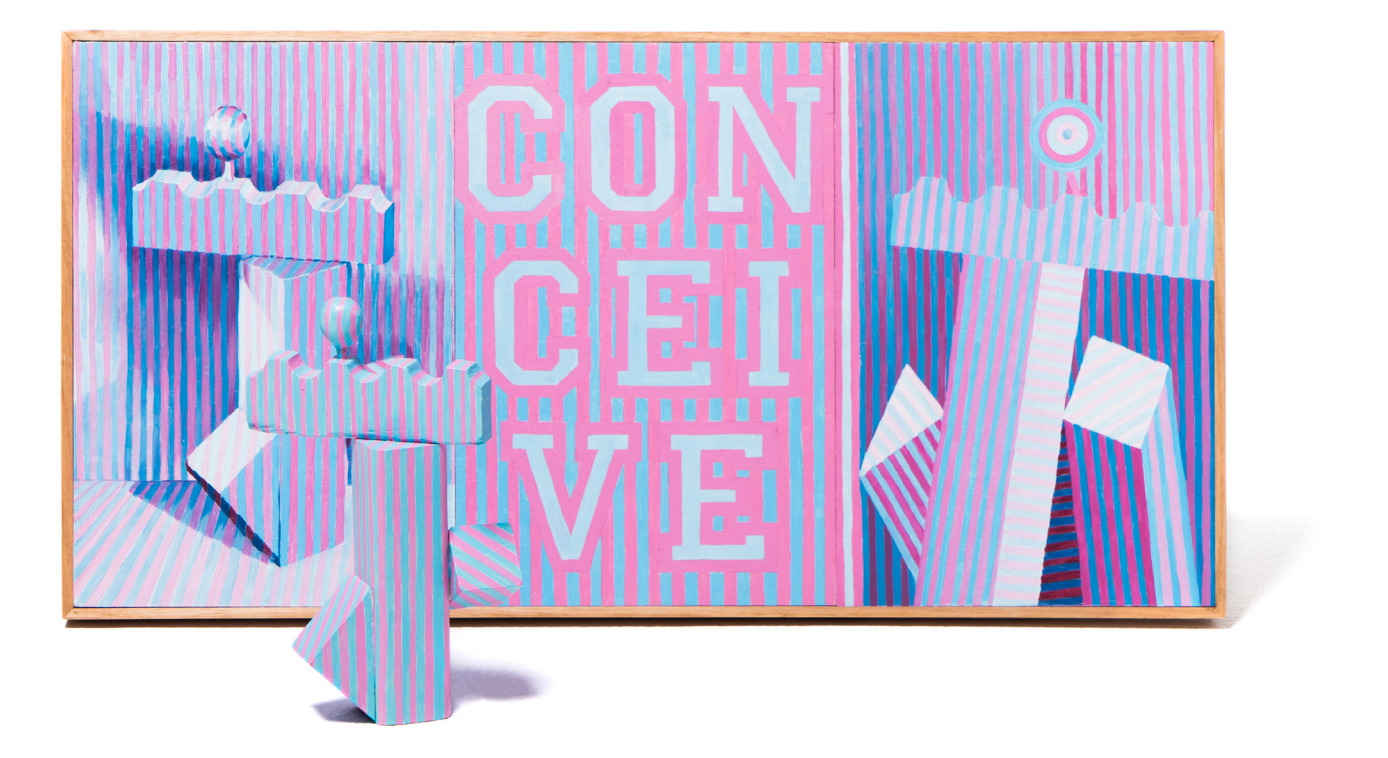
Image (cover): Leigh Schoenheimer, Ways of Seeing/Ways of Knowing: Construction #10, 2018, Oil on Plywood with assemblage of recycled timber and acrylic paint.

Image (above): Leigh Schoenheimer, Ways of Seeing/Ways of Knowing: Construction #5, 2017, Oil and acrylic on Plywood - Triptych with free standing, polychromed timber assemblage