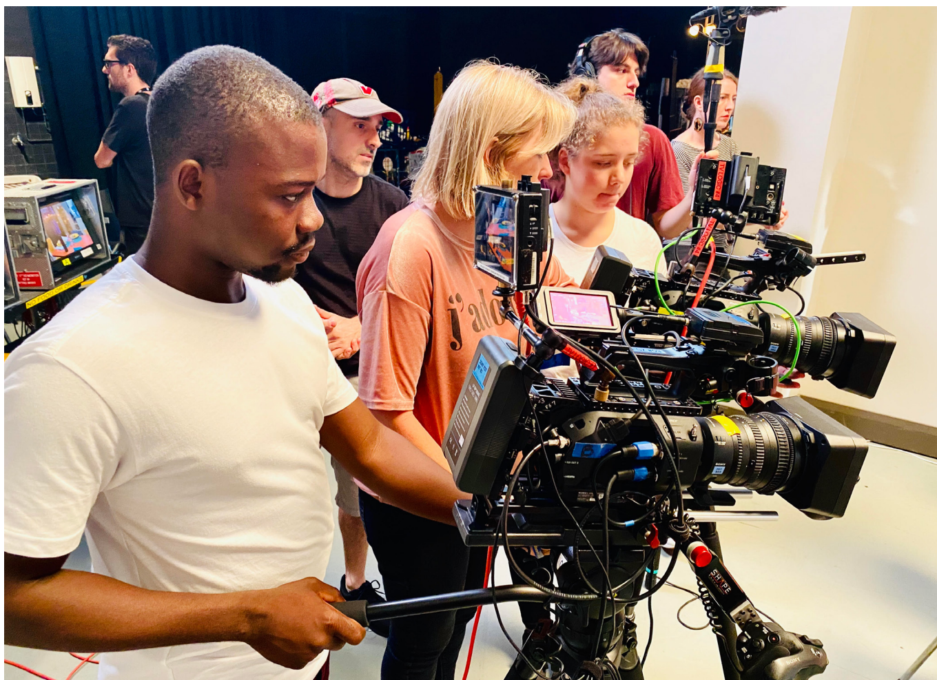
Participants at AFTRS Film intensive course thanks to RAF.