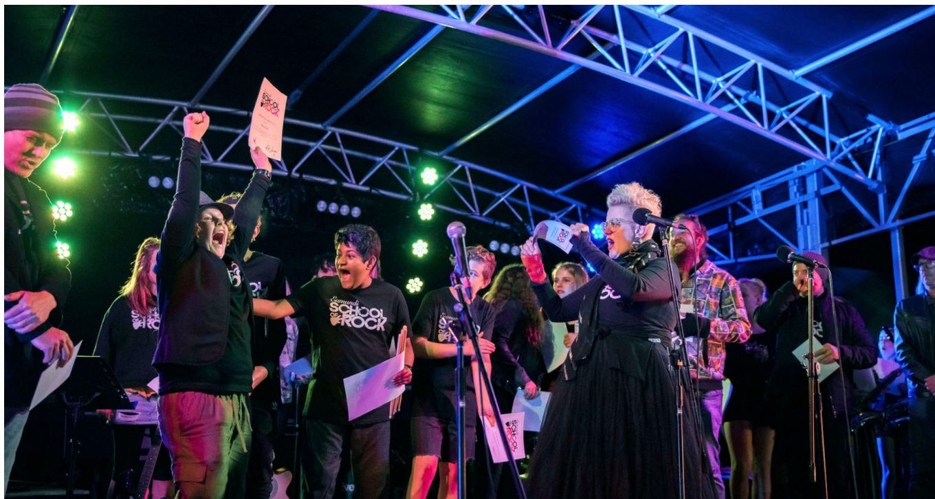
RAF grant recipients Eumundi School of Rock.

The fund is provided through Regional Arts Australia and is administered in Queensland by Flying Arts Alliance.