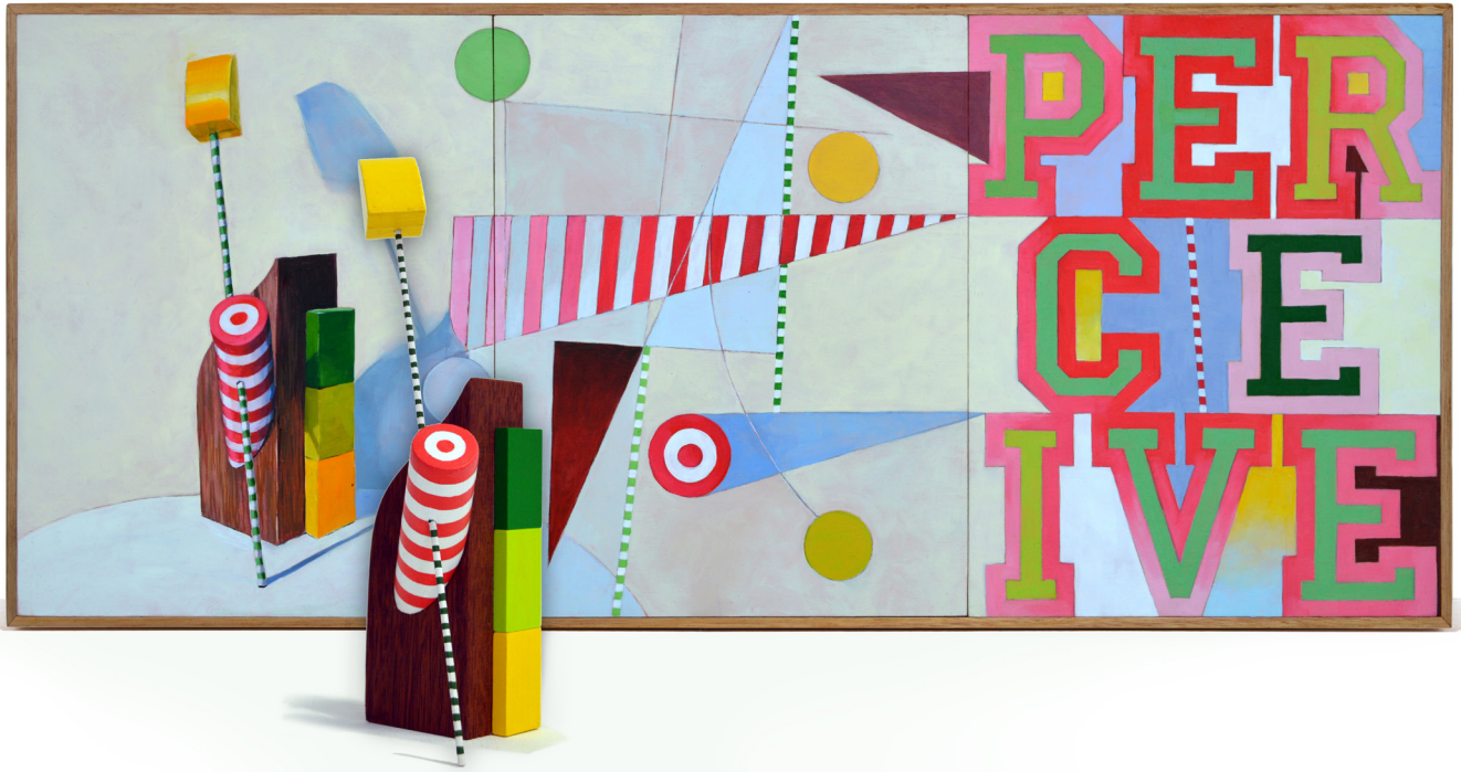
Artwork credit: Leigh Schoenheimer, Ways of Seeing/Ways of Knowing: Construction #13 , 2019, Oil on plywood triptych and free-standing timber assemblage, 32 x 73cm (painting) 25 x 8 x 8cm (assemblage).