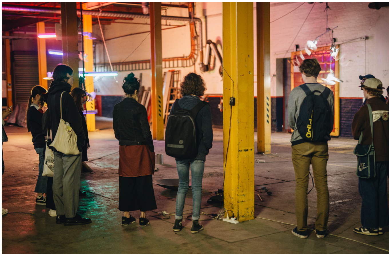
Participants at Art Enquirer program 2019.