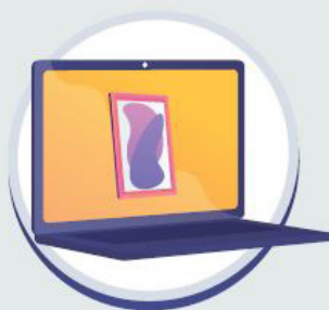
Arts Business & Management