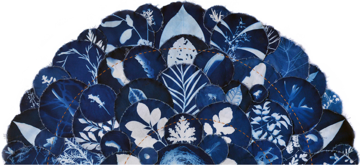
Artwork credit: LeAnne Vincent, Flourish (detail), 2020, Cyanotype photographs on cotton with thread, 104 x 104 x 3

Flying Arts offers a dynamic suite of touring exhibitions and accompanying public programs for show in regional Queensland galleries.