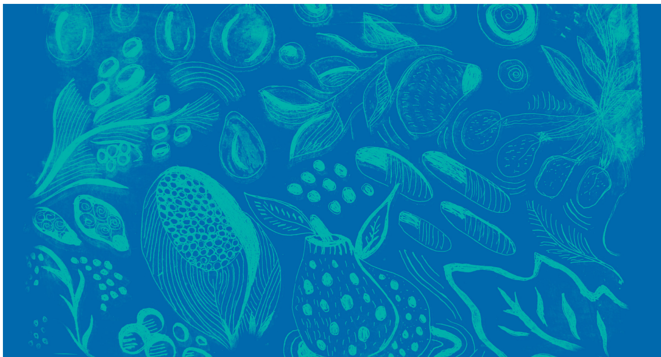
Image based on artwork by Edna Ambrym, Mayi Bugaam - Sea (Detail), 2017, Etching on paper, 49 x 59 cm (framed)