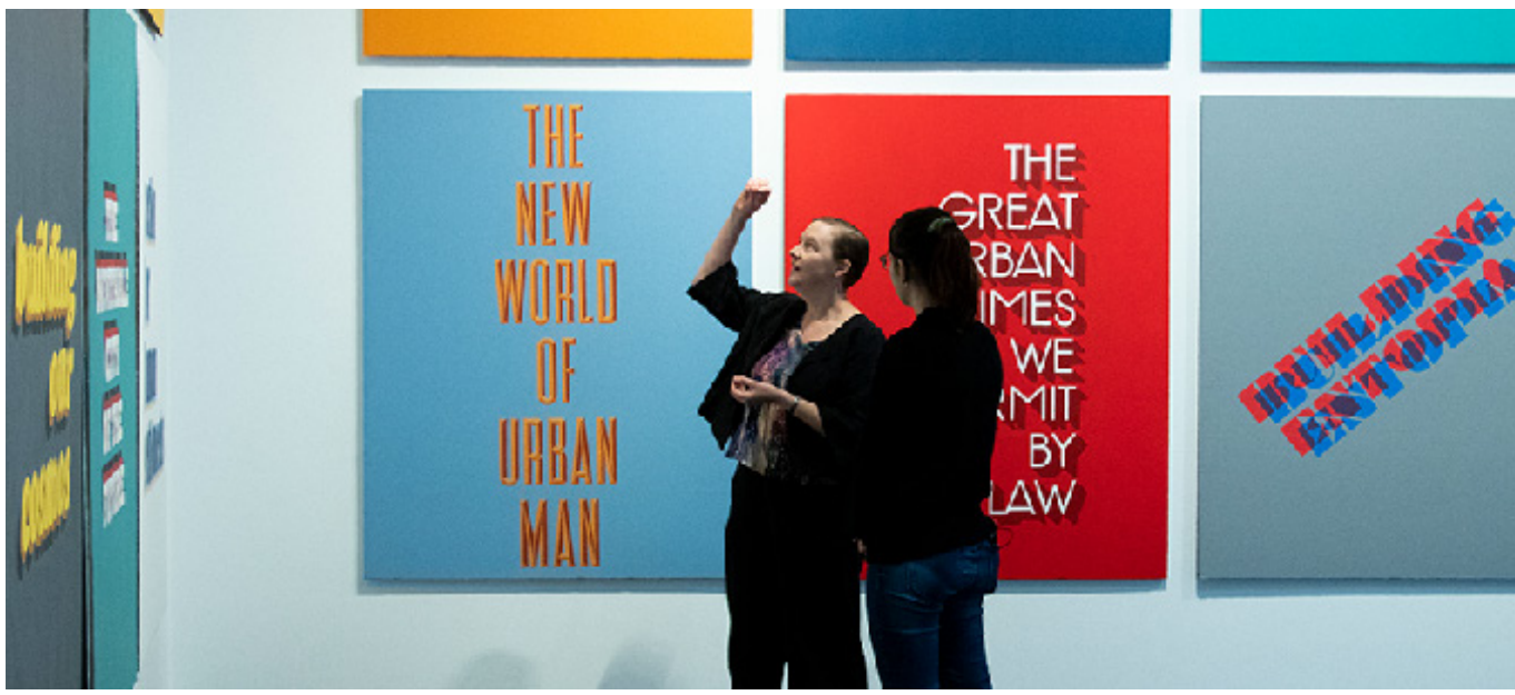
Above: Sam Cranstoun, Between Dystopia and Utopia, 2019. Installation view, "To Speak of Cities", UQ Art Museum, 2020.

Learn more about programs for Artists & Arts Workers at flyingarts.org.au