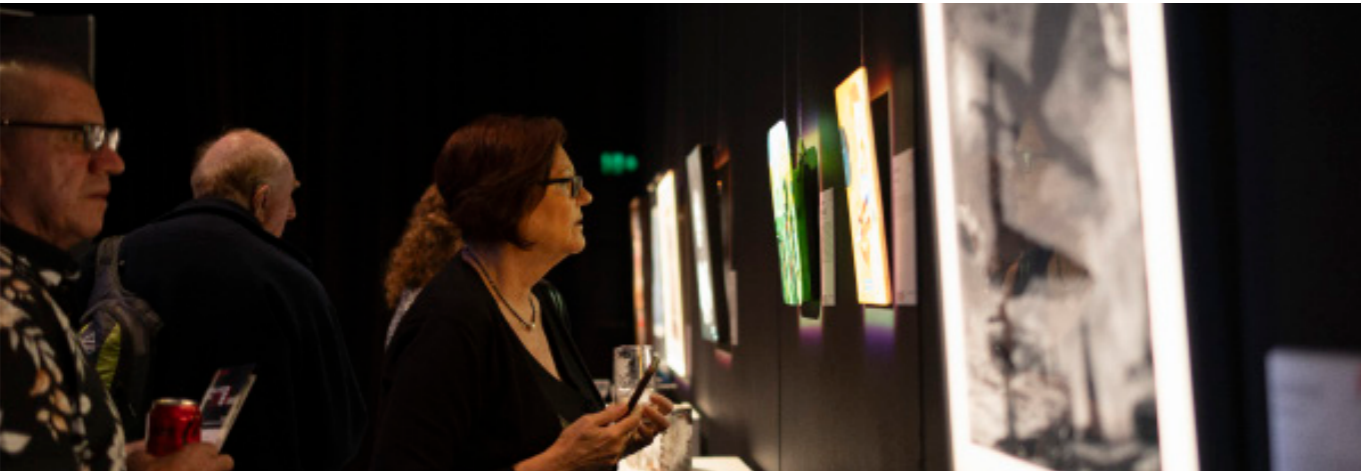
Above: Guests at the QRAA Gala held at the Judith Wright Arts Centre.

In 2024, as part of their winnings in the 2023 QRAA, four regional artists will have solo exhibitions at the Judith Wright Arts Centre. This is an invaluable experience for these artists, many of whom have never exhibited, let alone had a solo show. On display will be a collection of their works, including the winning piece of the 2023 QRAA.