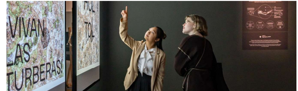
Above: Cultural Mediation in practice.