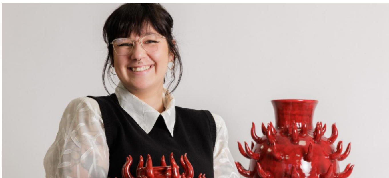
Above: The Body Vessel: Desire by Aurora Elwell

The Regional Arts Fund (RAF) is an Australian Government program designed to benefit regional and remote* arts practitioners, arts workers, audiences, and communities.