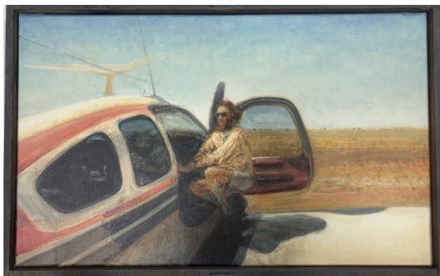
Aaron Butt, The Flying Artist, 2023 - Portrait of Mervyn Moriarty OAM, Flying Arts' Legendary Founder.

The Mervyn Moriarty Landscape Award Touring Exhibition is the inaugural tour of the finalists from the 2023 QRAA award category. The selected artists, chosen by finalist judge Jonathan McBurnie, will have their work showcased across the state, accompanying the 2023 QRAA Perspective Touring Exhibition, and also featuring as a stand alone show.