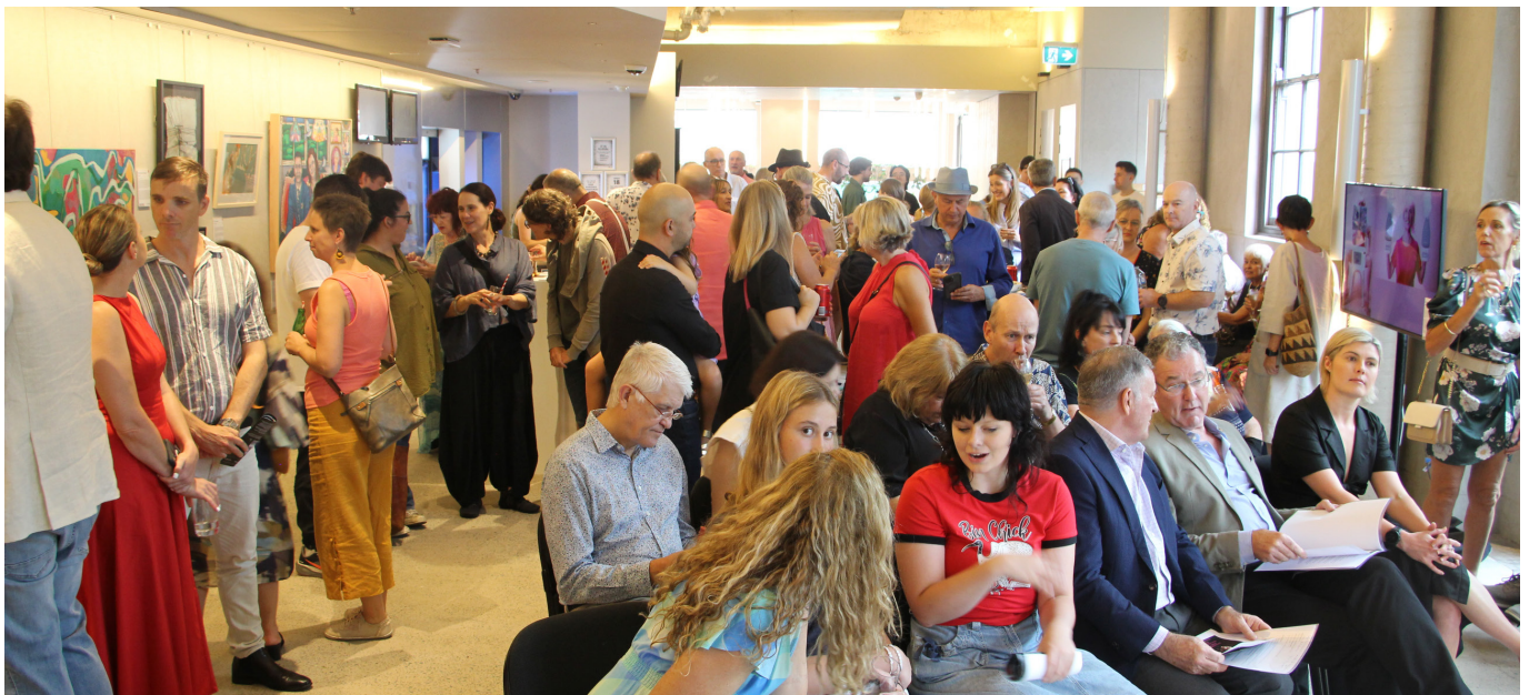
Above: Guests at 2024 QRAA Emerging Artists Award Exhibition held at Judith Wright Arts Centre.