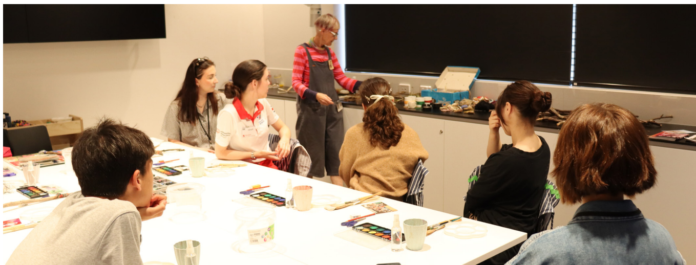
Above: The Visual Field in Rockhampton (2024)

Curious about a career in the arts after school? Our Young Creatives Programs provide an opportunity for young artists aged 14 – 18 to develop their creative practice and find career opportunities in the arts.