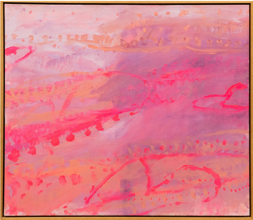
Above: Looking for the Pink Opal (Above Ground), Karen Stephens, 2024.