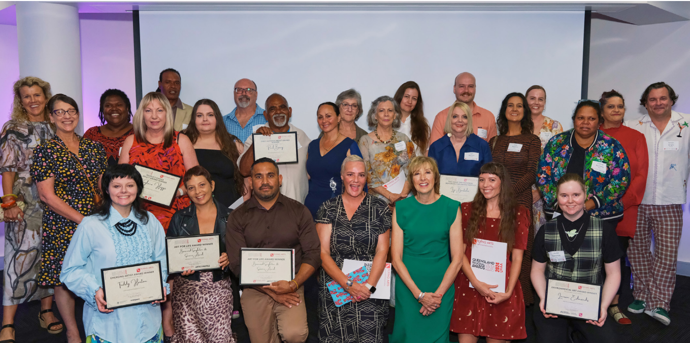
Above: Award Winners at the 2024 QRAA Gala.