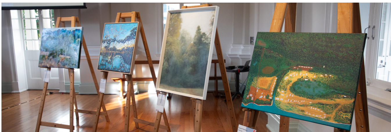
Above:: The 2024 Mervyn Moriarty Landscape Award Exhibition at Cairns Court-House Gallery.

Thanks to QRAA The Mervyn Moriarty Landscape Award Sponsors