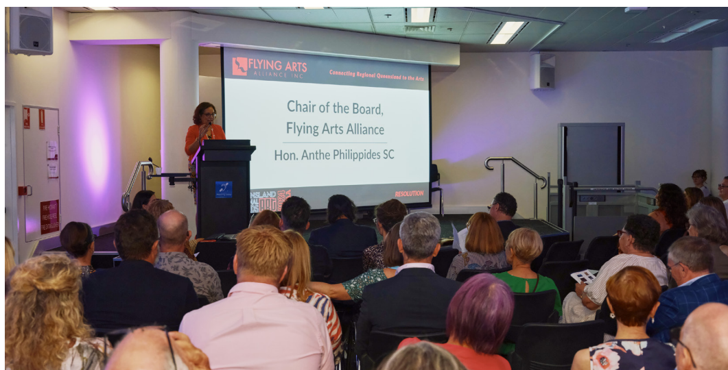
Above: Flying Arts Alliance Chair speaking at the QRAA 2024 Gala.