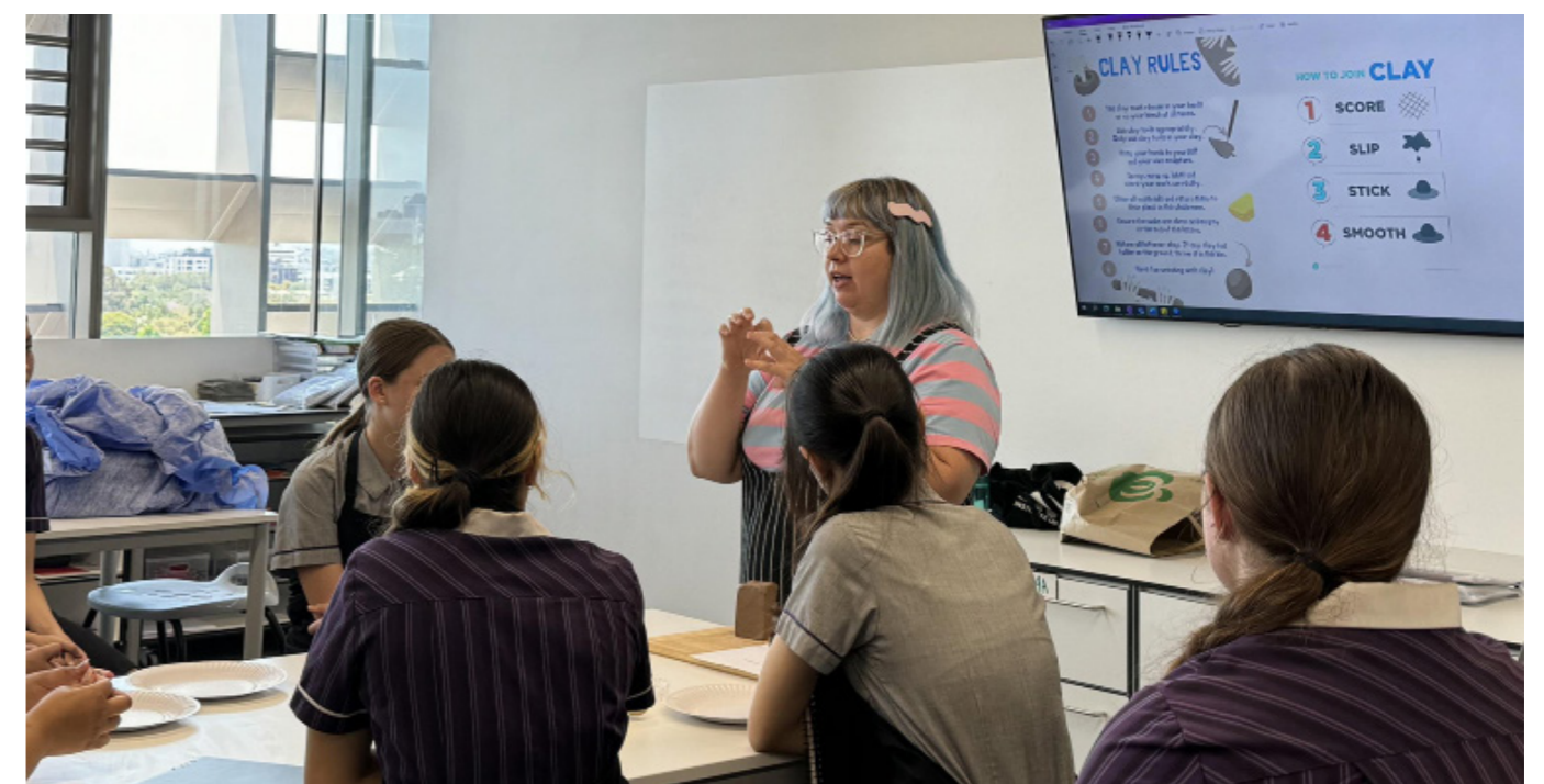
Above: Students participating with a By Request facilitator in a clay workshop.