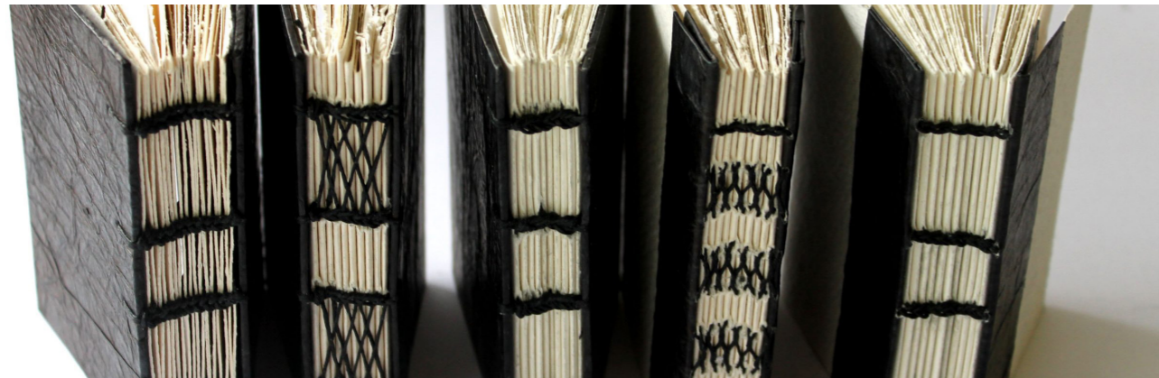
Above: Example of work from Clever Coptic Book Binding Workshop.

As part of Perspective , the touring exhibition of the 2023 Queensland Regional Art Awards (QRAA), Flying Arts presents a series of creative communities engagement workshops at the QRAA touring exhibition locations. These group workshops, open to the public, will include a range of professional development workshops. There will also be opportunities to learn first hand from some of the exhibiting award-winning artists about their artistic practice and what inspired their winning artwork.