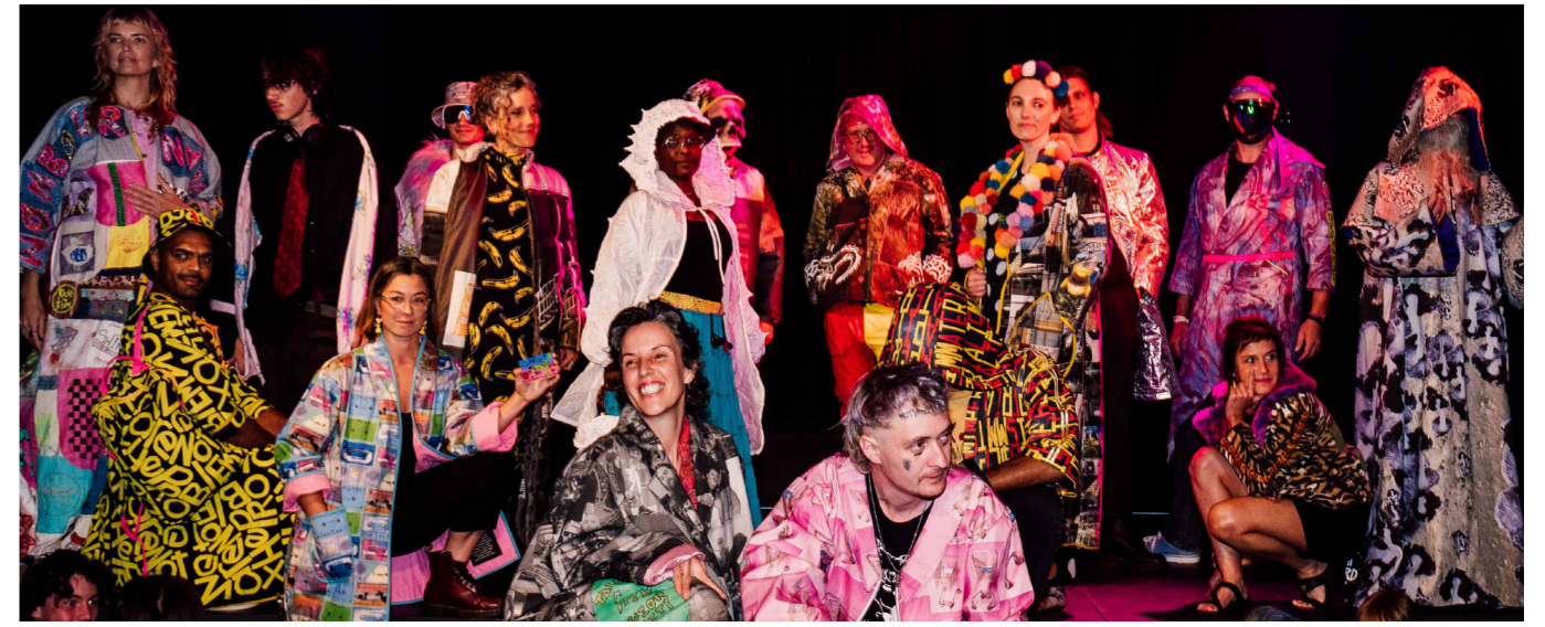
Above: Quick Response Grant: The Sunshine Coat. Image: Sunshine Coat Runway.