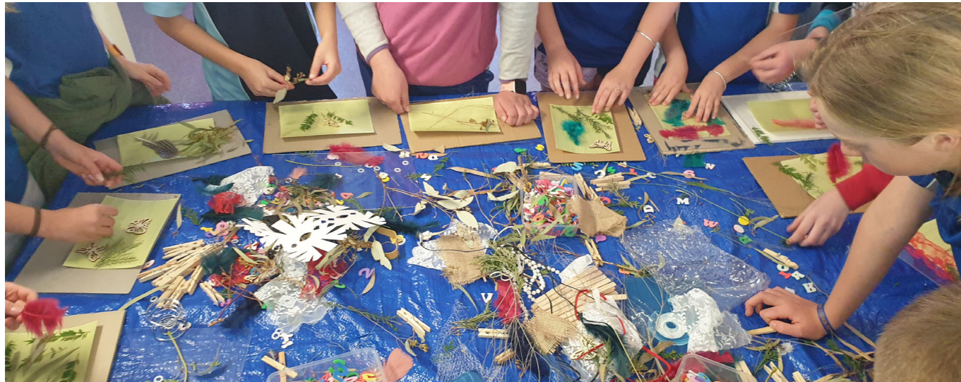
Above: Students assembling designs for cyanotype printing.

Are you struggling to find ways to enhance your students or community groups creative engagement? Our By Request program offers a multitude of unique, tailored experiences to suit your specific challenges and needs in the visual arts and other creative practices.