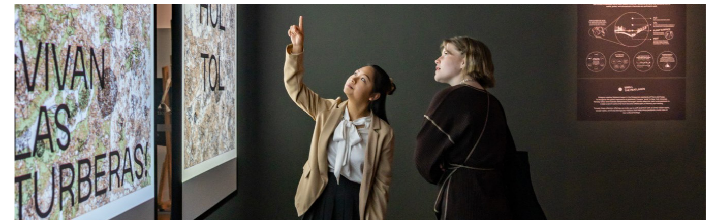
Above: Cultural Mediation in practice.