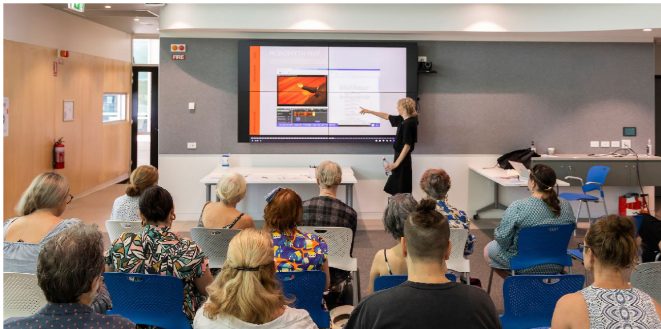
Above: By Request workshop on Art and AI.

We have a diverse and experienced team of artists and other creatives available all over Queensland. Our services are fully inclusive of facilitator fees, insurances, travel and accommodation allowances and are priced affordably.