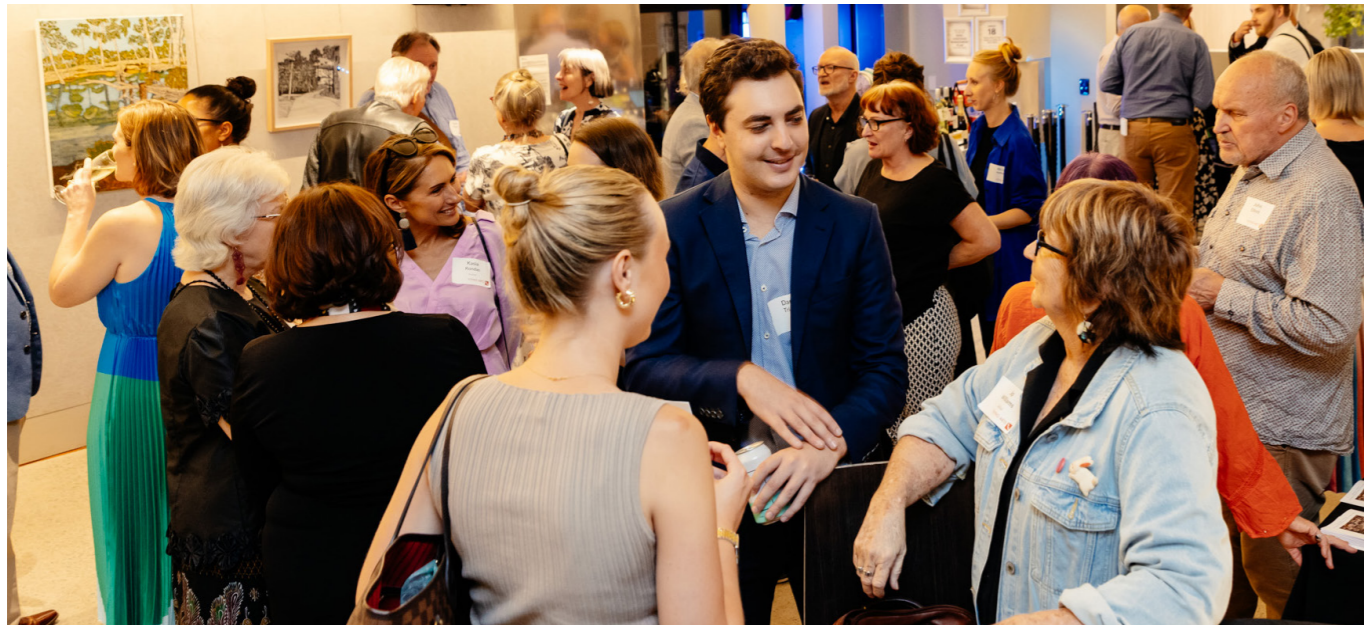
Above: Guests at The Mervyn Moriarty Landscape Award Exhibition 2023 held at the Judith Wright Arts Centre.