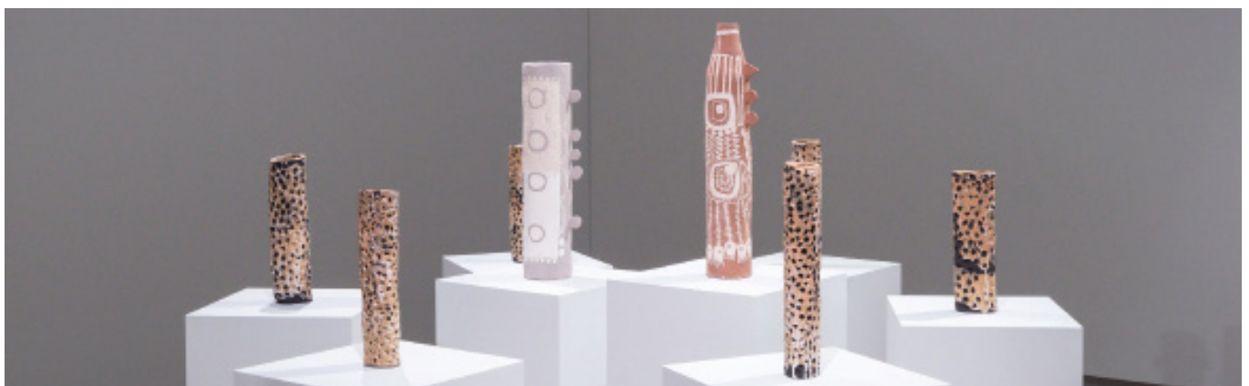
Above: Winning entry of The Mervyn Moriarty Landscape Award, Red Kangaroo and Little River Rock Cod , ceramic installation, 2023, by Naomi Hobson.