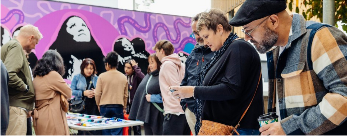
Above: Students enjoying creative programs in 2023