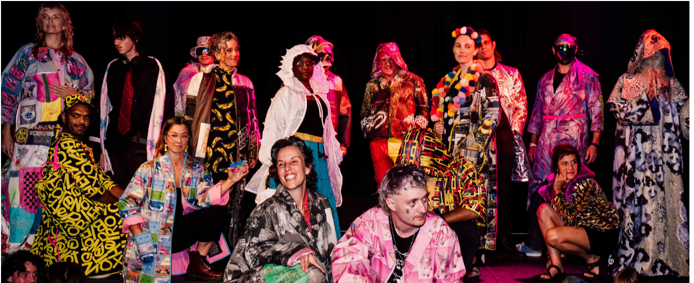
Above: Quick Response Grant: The Sunshine Coat. Image: Sunshine Coat Runway. Image credit: Warwick Gow.