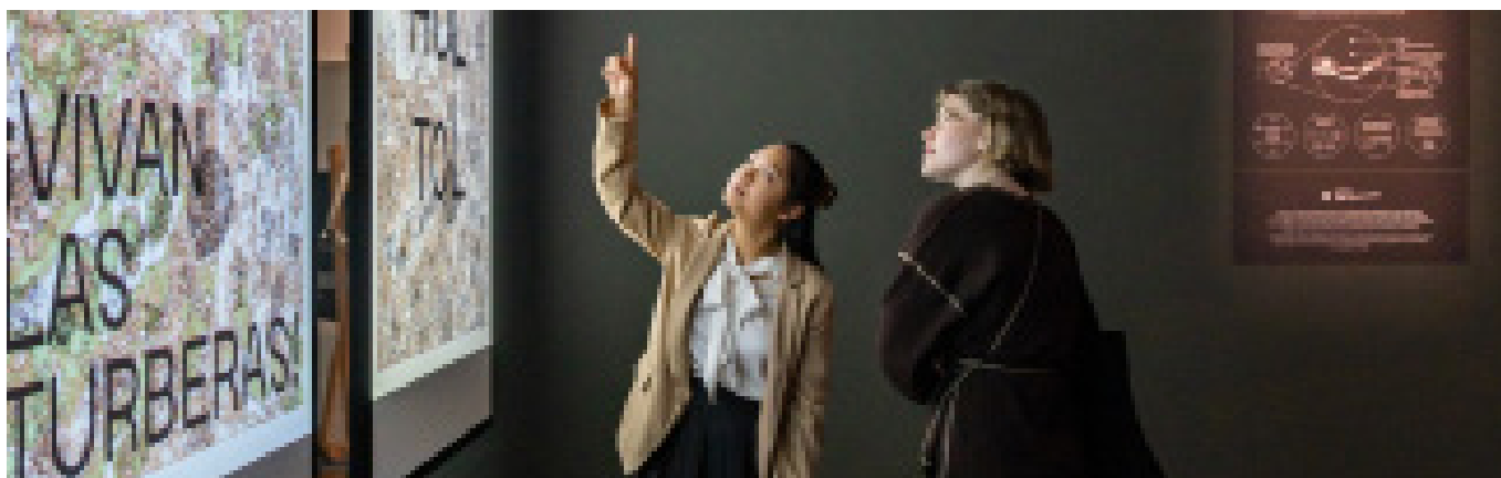
Above: Cultural Mediation in practice.