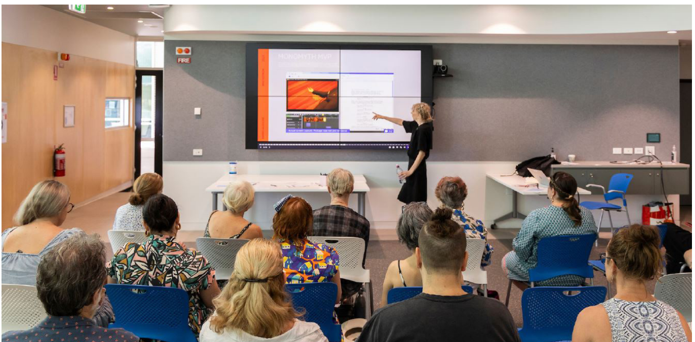
Above: By Request workshop on Art and AI.

We have a diverse and experienced team of artists and other creatives available all over Queensland. Our services are fully inclusive of facilitator fees, insurances, travel and accommodation allowances and are priced affordably.