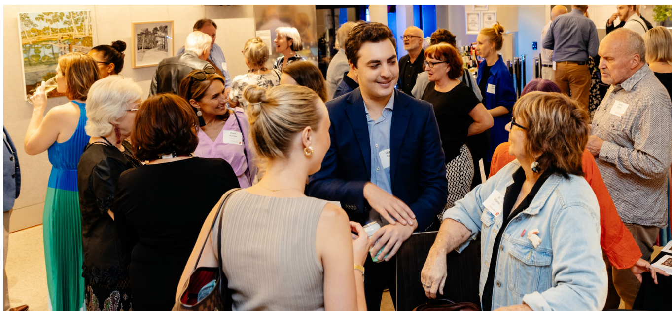
Above: Guests at The Mervyn Moriarty Landscape Award Exhibition 2023 held at the Judith Wright Arts Centre.