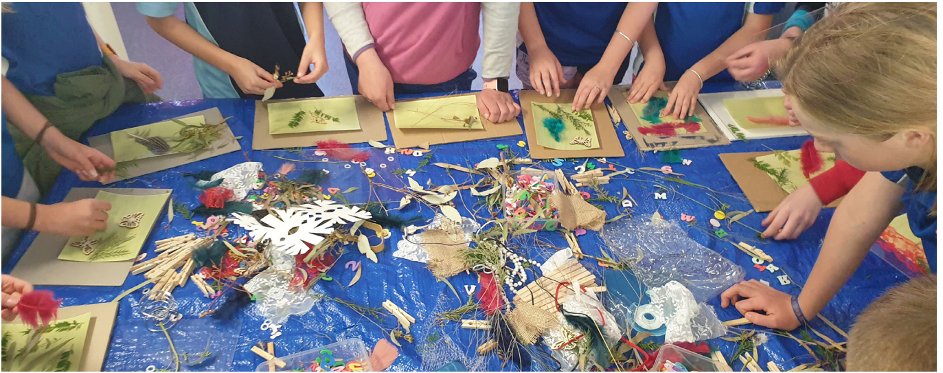
Above: Students assembling designs for cyanotype printing.

Are you struggling to find ways to enhance your students or community groups creative engagement? Our By Request program offers a multitude of unique, tailored experiences to suit your specific challenges and needs in the visual arts and other creative practices.