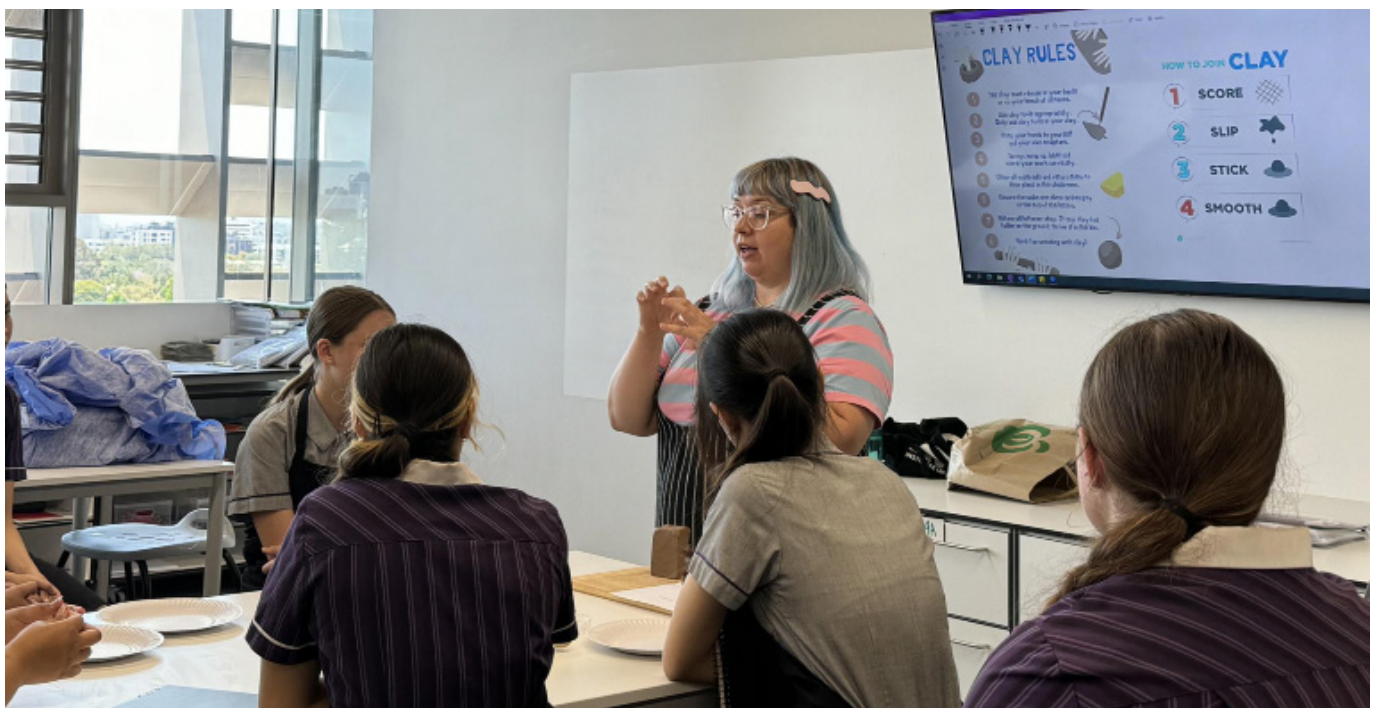
Above: Students participating with a By Request facilitator in a clay workshop.