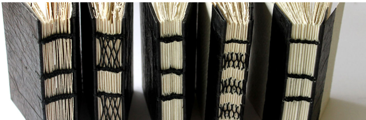
Above: Example of work from Clever Coptic Book Binding Workshop.

As part of Perspective , the touring exhibition of the 2023 Queensland Regional Art Awards (QRAA), Flying Arts presents a series of creative communities engagement workshops at the QRAA touring exhibition locations. These group workshops, open to the public, will include a range of professional development workshops. There will also be opportunities to learn first hand from some of the exhibiting award-winning artists about their artistic practice and what inspired their winning artwork.