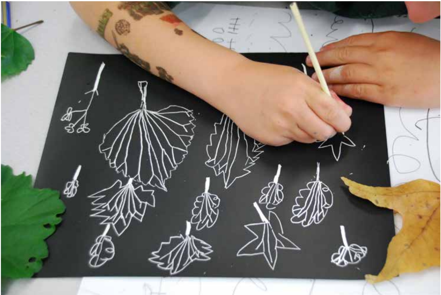
Small Schools Mentorship Program at Meandarra State School 29 August 2016.