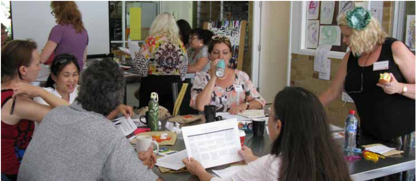
Top Left: Connecting Art with School Curriculum workshop Day 2 in Gladstone.