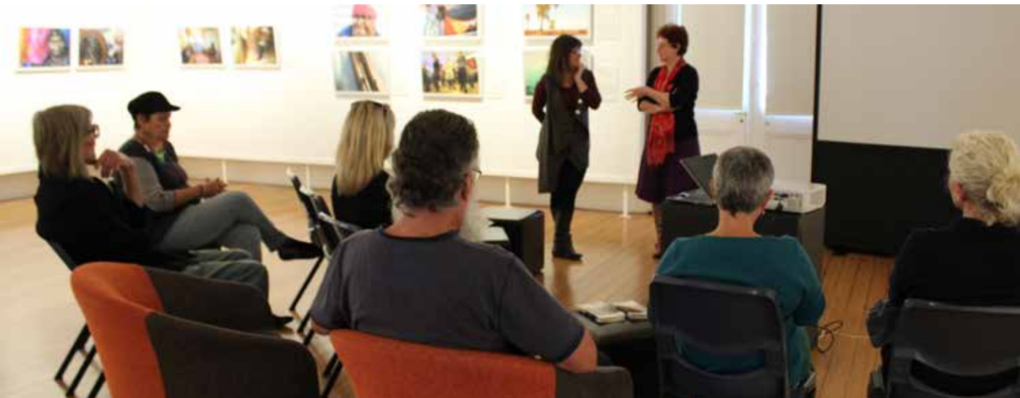
Top: Judith Parrott, 12B Seaweed Harvest, 2014, Giclée Print. Image supplied by artist