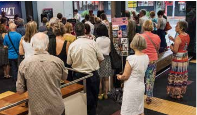
Above: Shift Exhibition launch.