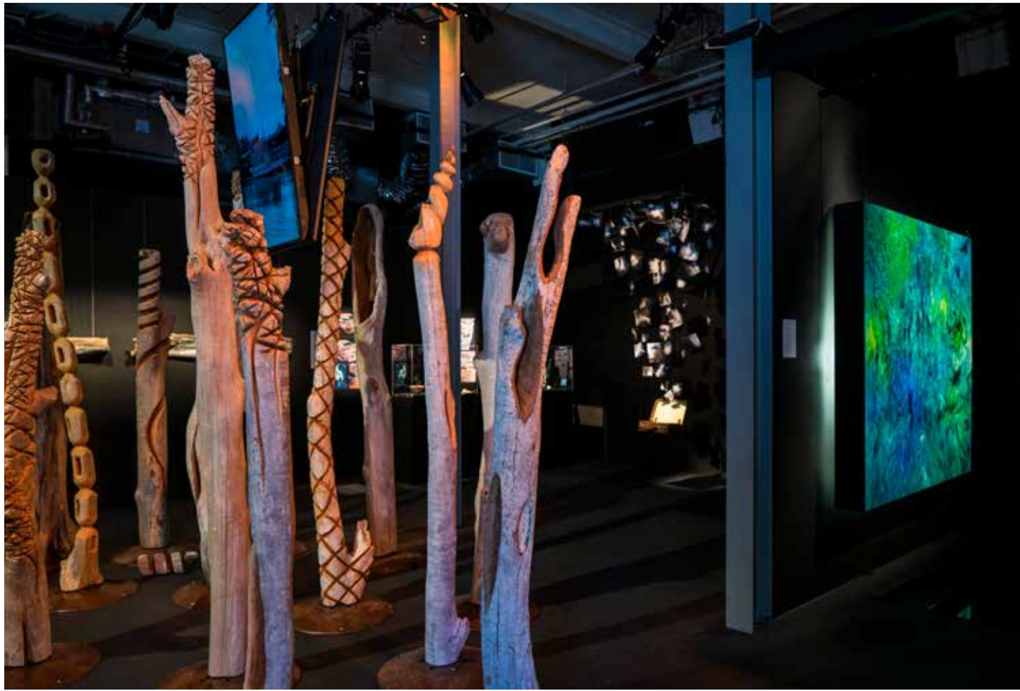
Above: Crush Festival Curator by Request Outcome - #tag and release exhibition, Shopfront Gallery, Judith Wright Centre of Contemporary Arts, Brisbane.

As part of the exhibition concept development, I have experimented with totally new directions in my art practice, striving to come up with new fresh work specifically tailored for this project.