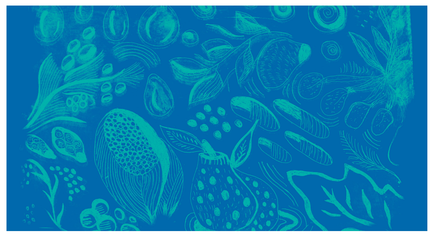
Image based on artwork by Edna Ambrym, Mayi Bugaam - Sea (Detail), 2017, Etching on paper, 49 x 59 cm (framed)