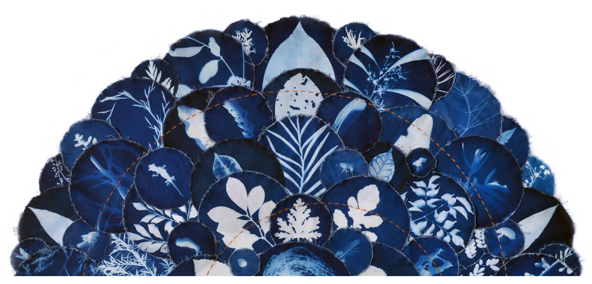
Artwork credit: LeAnne Vincent, Flourish (detail), 2020, Cyanotype photograms on cotton with thread, 104 x 104 x 3

Flying Arts offers a dynamic suite of touring exhibitions and accompanying public programs for show in regional Queensland galleries.