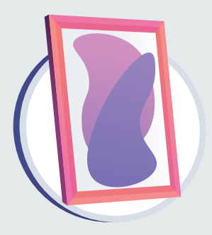
Exhibition Development and Support Services