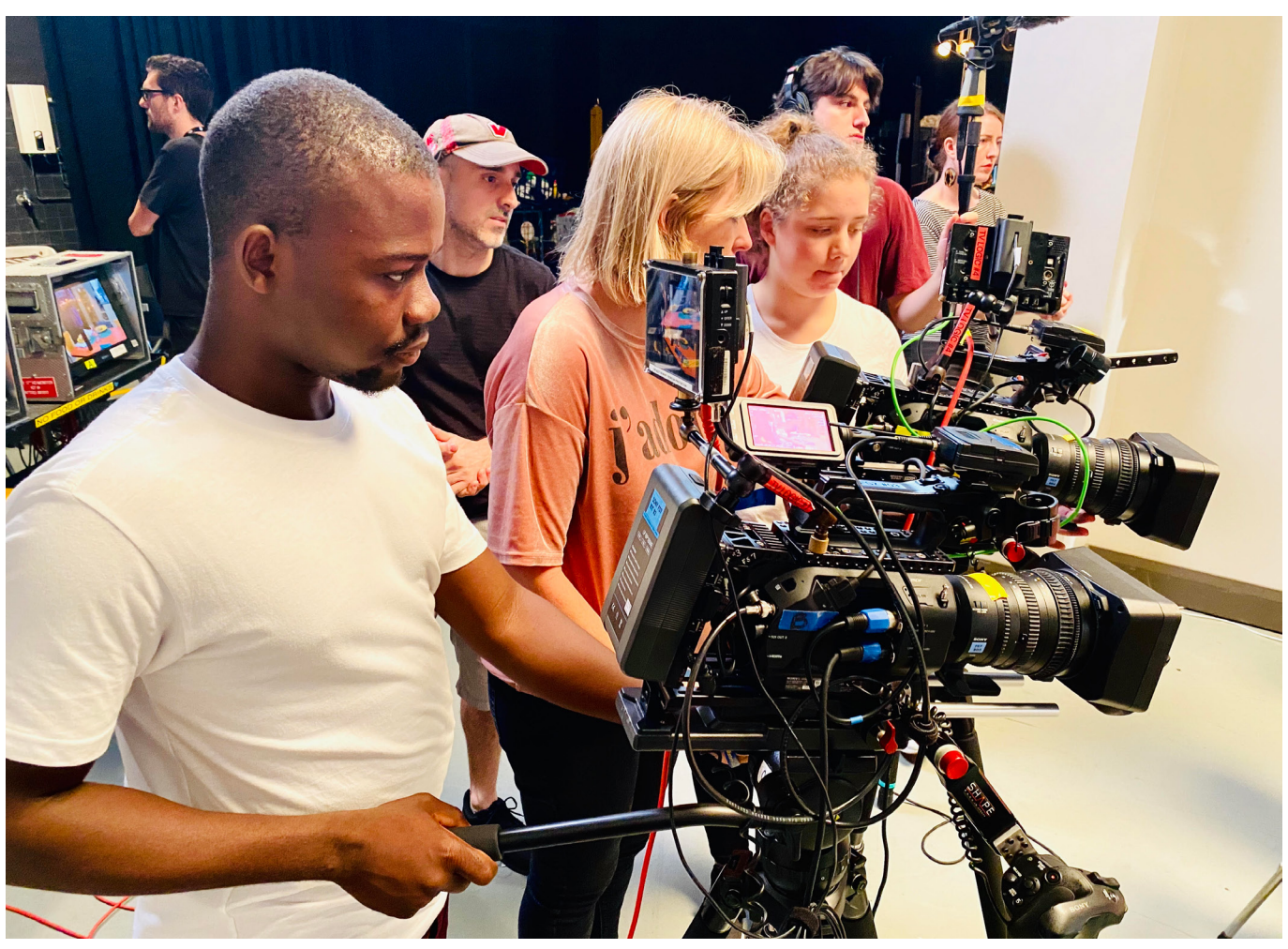
Participants at AFTRS Film intensive course thanks to RAF.