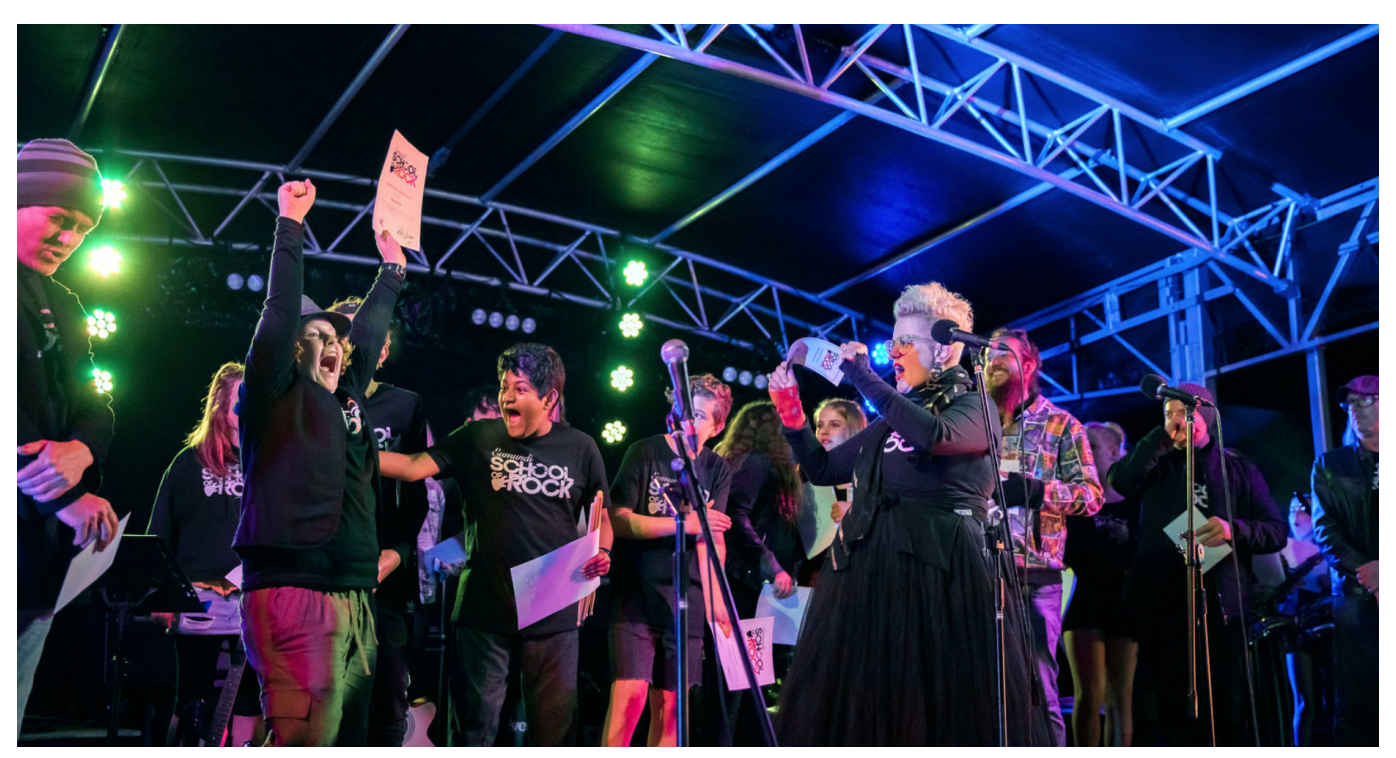
RAF grant recipients Eumundi School of Rock.

The fund is provided through Regional Arts Australia and is administered in Queensland by Flying Arts Alliance.