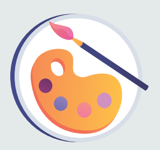
Visual Arts Practice