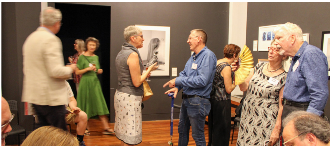
Opening of State of Diversity, 2019 QRAA touring exhibition.