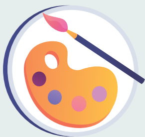
Visual Arts Practice