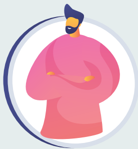
Arts Business & Management