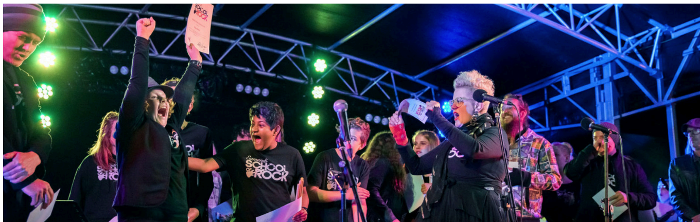
Regional Arts Fund RAF Relief Fund Recipient, Eumundi School of Rock, outdoor drive-in gig.

The fund is provided through Regional Arts Australia and is administered in Queensland by Flying Arts Alliance.