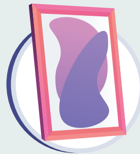
Exhibition Development and Support Services