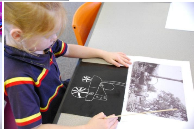
Using the Scratch Paper