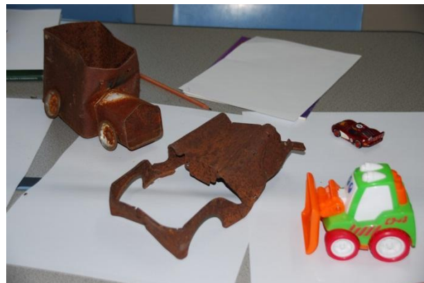
Tableau of still life objects - past and present